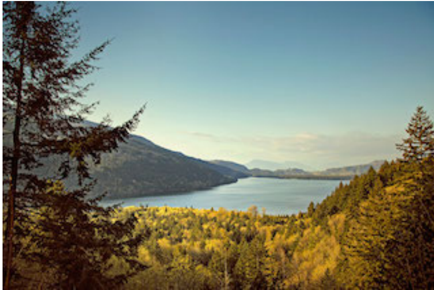
View from Stillwood Centre

(Centre cannot receive guests before 4PM Friday)